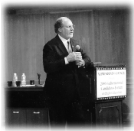
Jon Corzine called higher education "the most important economic development tool in our society."